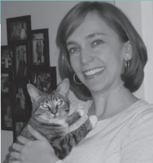
Sometimes you just walk into the shelter and fall in love!

Pet Adoption is a long-term commitment and should be considered thoughtfully. “I think I want to get a cat,” a friend said to me over dinner the other night. The words hung in the air as her husband shoved a forkful of food in his mouth and looked the other way. Being a very happy cat owner and knowing how many cats and kittens are at the shelter and in foster care waiting for their forever homes, I wanted to shout with joy.